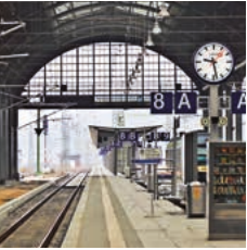
Outdoor analog double face