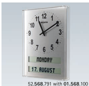
52.568.791 with 01.568.100

AluNox® is an anodised aluminium. While resistant to corrosion, detergents, and disinfectants, it is also abrasion-proof. The surface of AluNox® is visually very similar to stainless steel with a matted finish, yet is noticeably lighter and impervious against fingerprints. Therefore, AluNox® is excellently suited for areas where its visual resemblance of stainless steel will mainly serve decorative purposes.