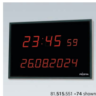
81.515.551 -74 shown