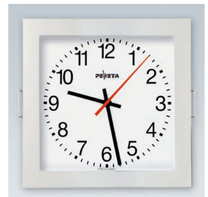
Clock 73.470.310 for in-wall mounting with spring-clip attachment device 01.470.301 for stud-and-panel wall mounting