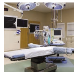
Indoor analog flush-mounted