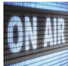
AirPort24 telegram function and advantages